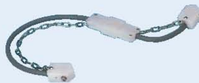
69 Disconnecting Door Cord