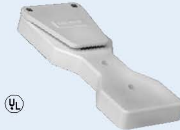
264 Money Clip