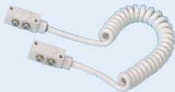
64 Retractable Slimline Stretch Door Cord